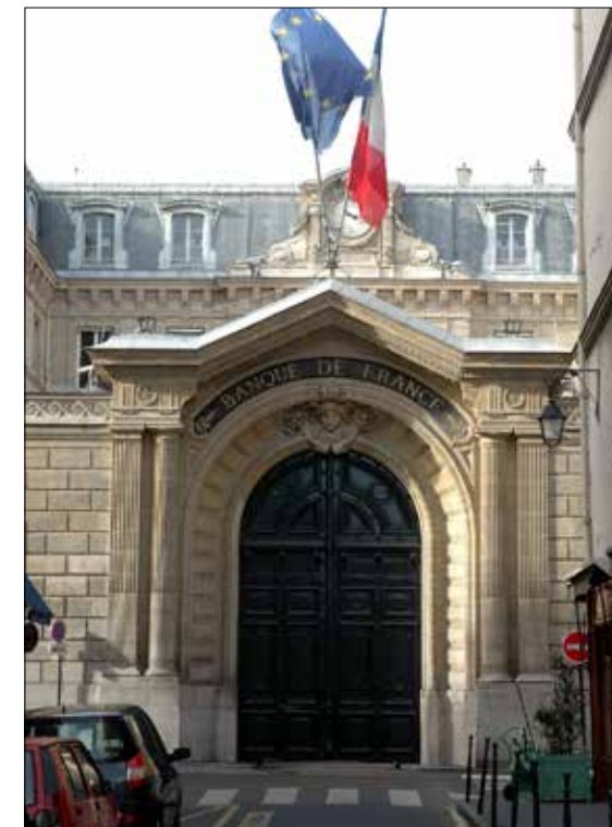
Banque de France offices in Paris.

Things began to change in 1987 when Prime Minister Jacques Chirac, himself the son of a banker, began a process of privatizing the banks. He later explained that he believed the industry needed to “shoulder its responsibilities to the business community.” 96