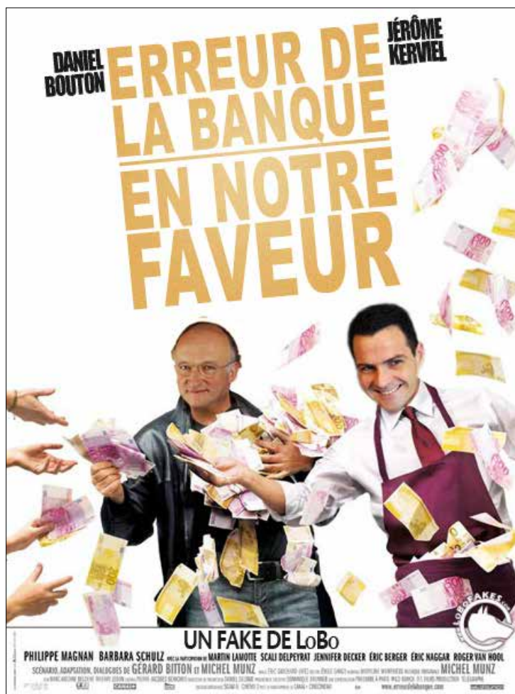
Parody of poster for French film: Bank Error in Your Favor .

his bet (as he often had in the past), he would have been given a generous bonus. 110