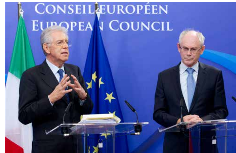
Mario Monti, former E.U. Competition Commissioner (left).

T he move by Greece, Spain, and Ireland to become eager customers of the Belgian, French, and German banks occurred within a continent-wide context. After the launch of the euro in 1999, European bureaucrats were talking up the planned “European Single Market in Financial Services” by championing the idea of banks competing against each other across the continent, regardless of national origin. They were eager for the staid old European banks to compete with the behemoth U.S. investment banks. Ever since the 1997 World Trade Organization negotiations on financial services began opening up Europe’s banking, insurance, securities and financial information markets, U.S. firms were increasingly encroaching on the Europeans’ territory. 160