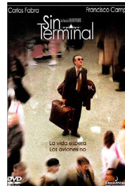
Parody of The Terminal poster. The caption reads: "Life is Expected, Just No Planes."

Some 75 kilometers south, a five-star, luxurious Hilton hotel offers panoramic views of Valencia, Spain's third largest city. The €110-million project—financed by Eurohypo—opened in 2008, and declared bankruptcy a year later. 167