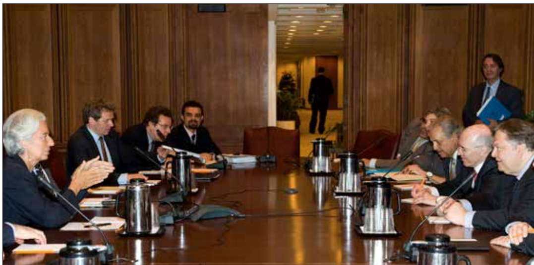
IMF director Christine Lagarde meets with Greek Finance Minister Evangelos Venizelos on July 25, 2011.

changed when Greece joined the third stage of the European Monetary Union (EMU), and became eligible to use euros and get cheap foreign loans.