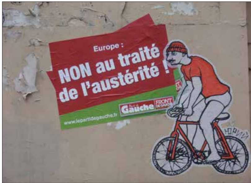
Left Party France poster. The caption reads: "Europe: Say no to austerity deal"

and to pay off the debts of three banks—Anglo Irish Bank, Allied Irish Bank, and Bank of Ireland. 252