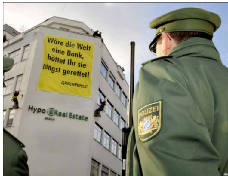
Greenpeace protest outside Hypo Real Estate offices in Frankfurt, March 2009. The sign reads: “If the world were a bank, you would have already saved it.”