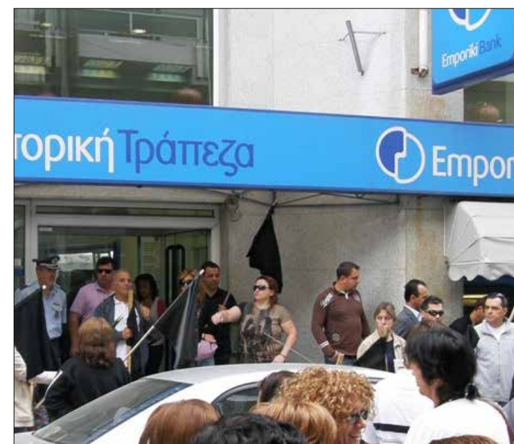
Protest outside Emporiki bank in Komotini, Greece, in 2009.

“We know that we can expect to do acquisitions in countries where we know people,” he confidently told