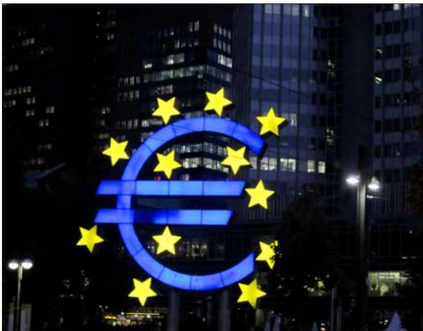
Euro sign outside European Central Bank in Frankfurt.

spending. Greece, Ireland and Spain (as well as Italy and Portugal) became locked into a vicious cycle of austerity.