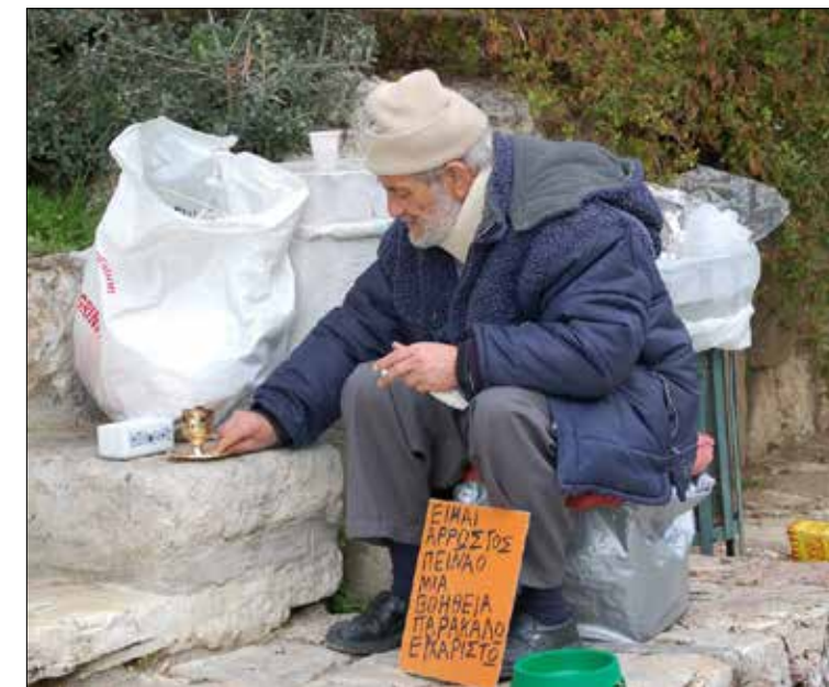
Beggar outside Agios Dimitrios. His sign reads: “I am sick, and hungry. Please help me. Thank you.”

Zografou was not the only council to ask Dexia for money for shaky municipal schemes. In 2006 Melisia and Volos Councils each borrowed €4.5 million from