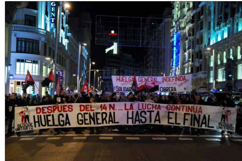
November 15 rally against austerity in Madrid.

The three countries we have described—Greece, Ireland, and Spain—now face years of crippling debt to pay for the last decade’s lending spree by Belgian, French, and German banks.