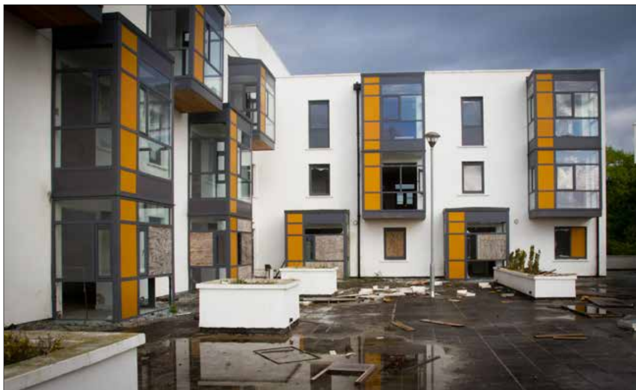
Ghost estate in Ballisodare, Ireland.

Both WestLB and Sachsen had tens of billions financed through a range of risky financial vehicles that they set up in Ireland, which issued complex instruments like asset-based commercial paper (ABCP). 219