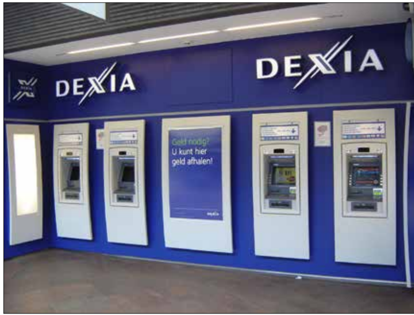
Dexia ATM in Antwerp