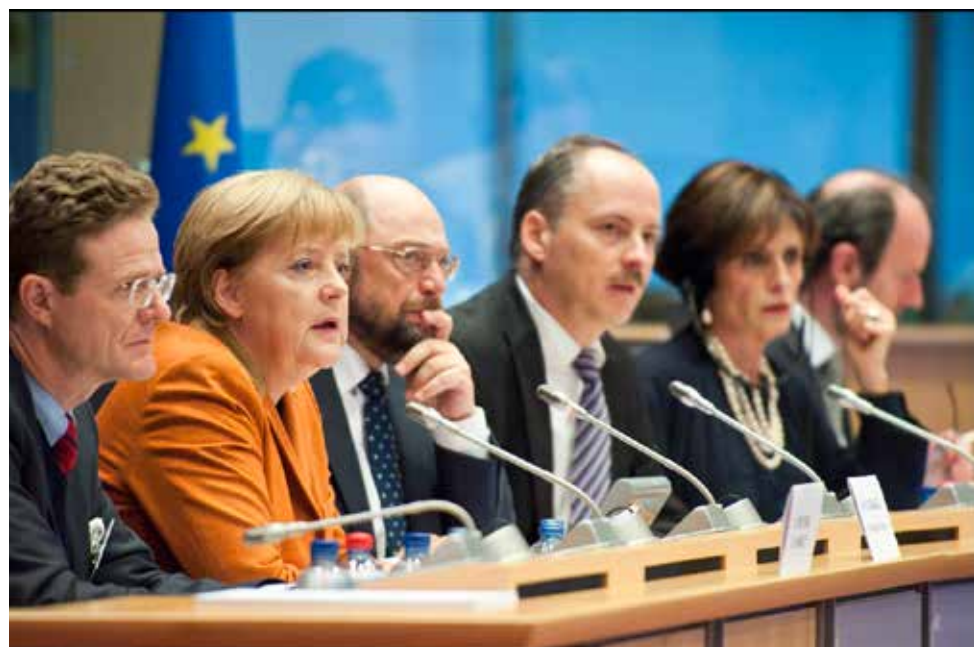
Chancellor Angela Merkel addresses the European Parliament.

or Citibank, Germany had 4,000 unique institutions in 1990 that comprised a three-pillar system of savings banks, co-operative banks, and private banks. The first two provide the bulk of the lending to the “mittelstand” (small- and medium-sized enterprises from households to niche family-owned companies), while the private banks serve major businesses. 28