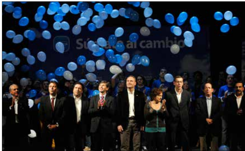
Partido Popular campaign event in Castellón, November 2011.

in Partido Popular, which ran Spain from 1996 to 2004. 172