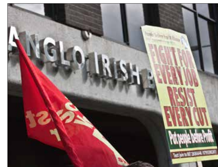
European Day Of Action protest march outside Anglo Irish Bank in September 2010.

The scheme drew a tight concentration of major European banks. If you stand in front of the Jeanie Johnston , a replica of a boat that took 19 th century Irish emigrants to the Americas, you can look straight down