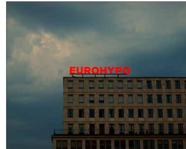
Eurohypo offices in Berlin.

Eurohypo was created in late 2001 when Commerzbank, Dresdner Bank, and Deutsche Bank—three of Germany's biggest private banks—merged their real estate portfolios. The move was meant to salvage ventures