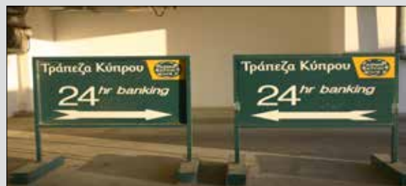
Bank of Cyprus sign