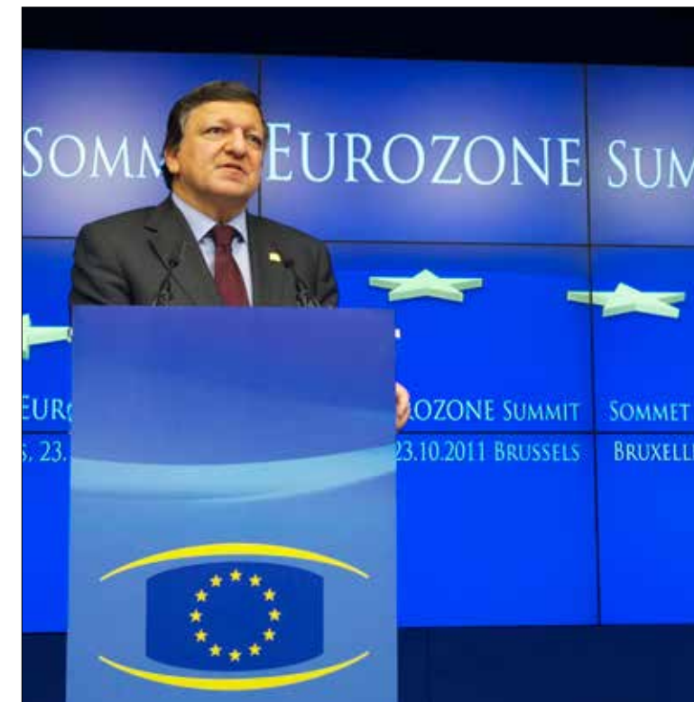
José Manuel Barroso, President of the European Commission, speaking at the EuroZone Summit in October 2011.